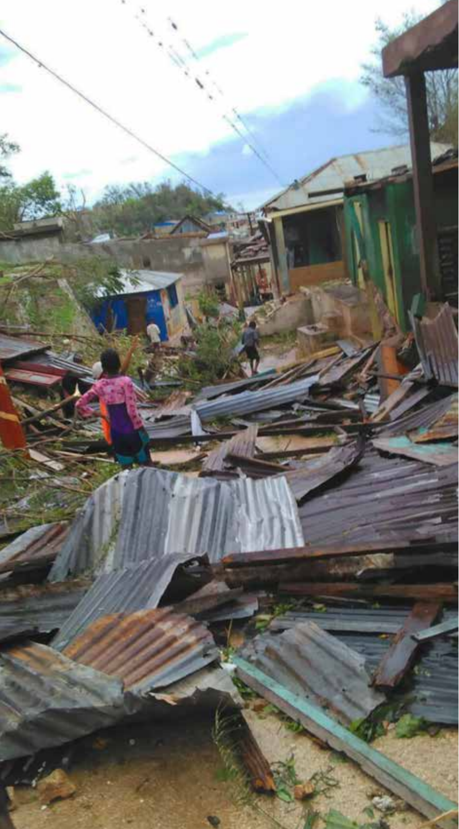
◀ Destruction by Hurricane Matthew in the southern peninsula