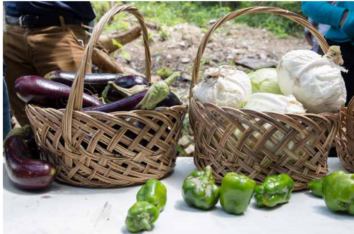
Vegetables from agricultural initiative ▶

GRANTS WERE GIVEN TO RELIABLE INITIATIVES (PRIOR TO HURRICANE MATTHEW)