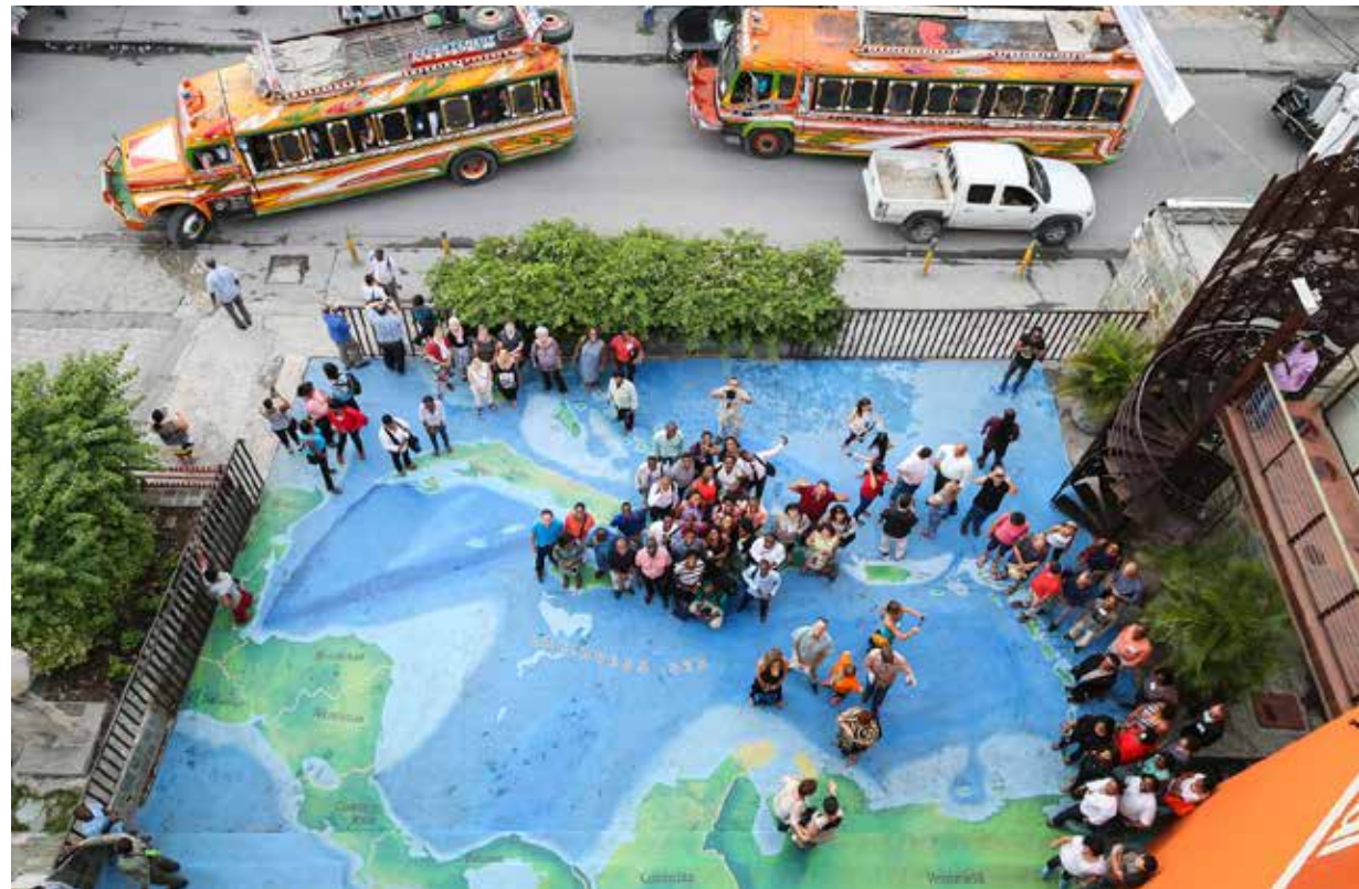
FOKAL resource center street entrance ▼