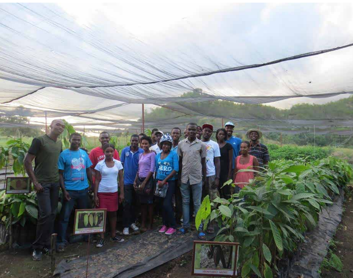
Ayitika staff in nursery before the Hurricane ▲

In Camp-Perrin, the social enterprise AYITIKA SA is working to identify and characterize native cocoa varieties with high productive and aromatic potential, and establish its own plots and provide technical support to small-scale producers in the region. Since 2015, with a grant from FOKAL, AYITIKA SA was in the process of accompanying 26 young people from Moreau (near Camp-Perrin) in the establishment of agroforestry systems based on cocoa on ten hectares of land. This group was composed of taxi-motorcycle drivers, agronomy students, social studies students, local craftsmen who were interested in staying in their community while learning new skills.