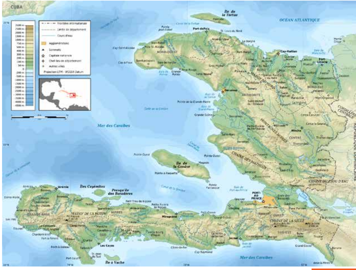
◀ The border city of Anse à Pitres *