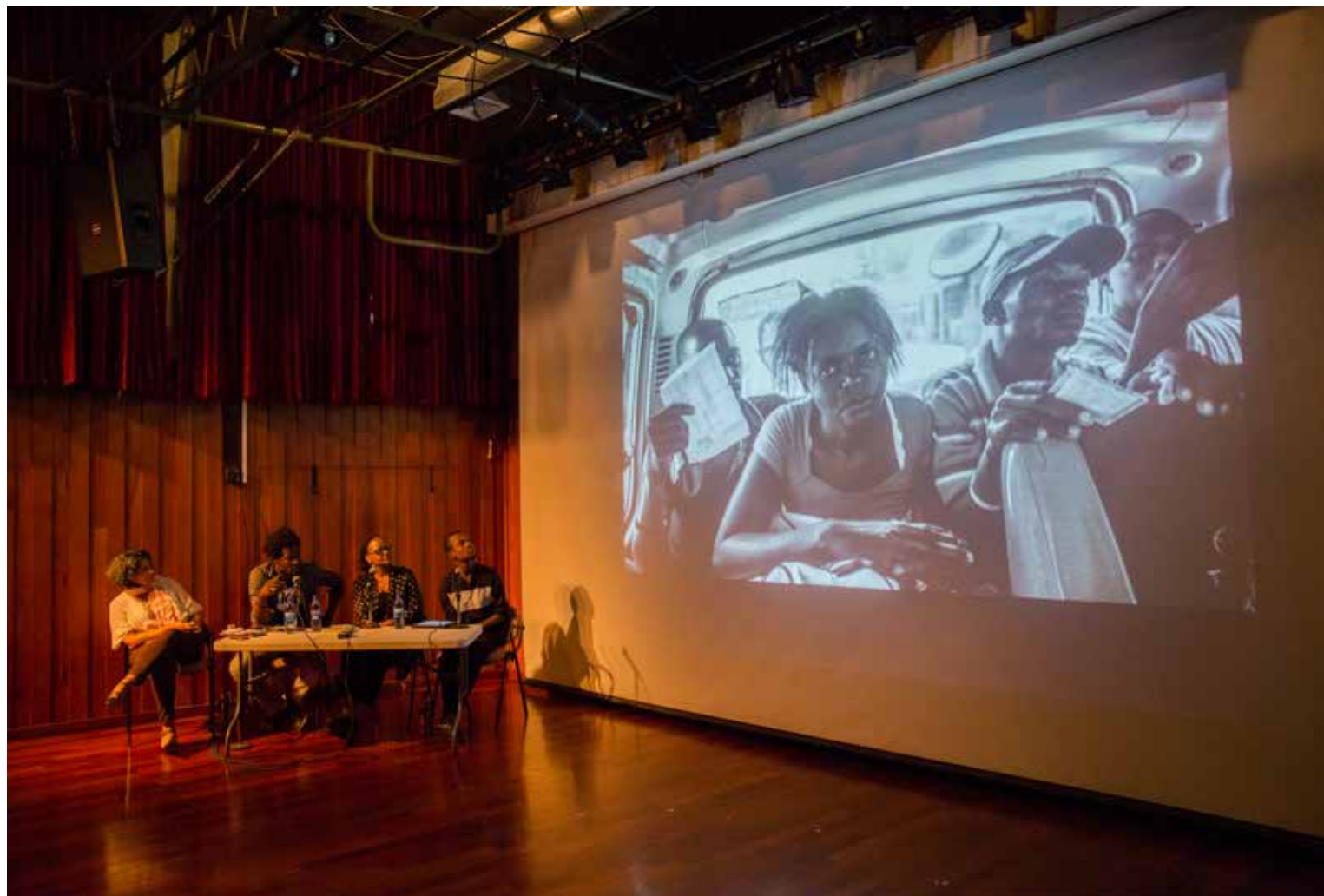
Conference about the Haitian Dominican relations ▲