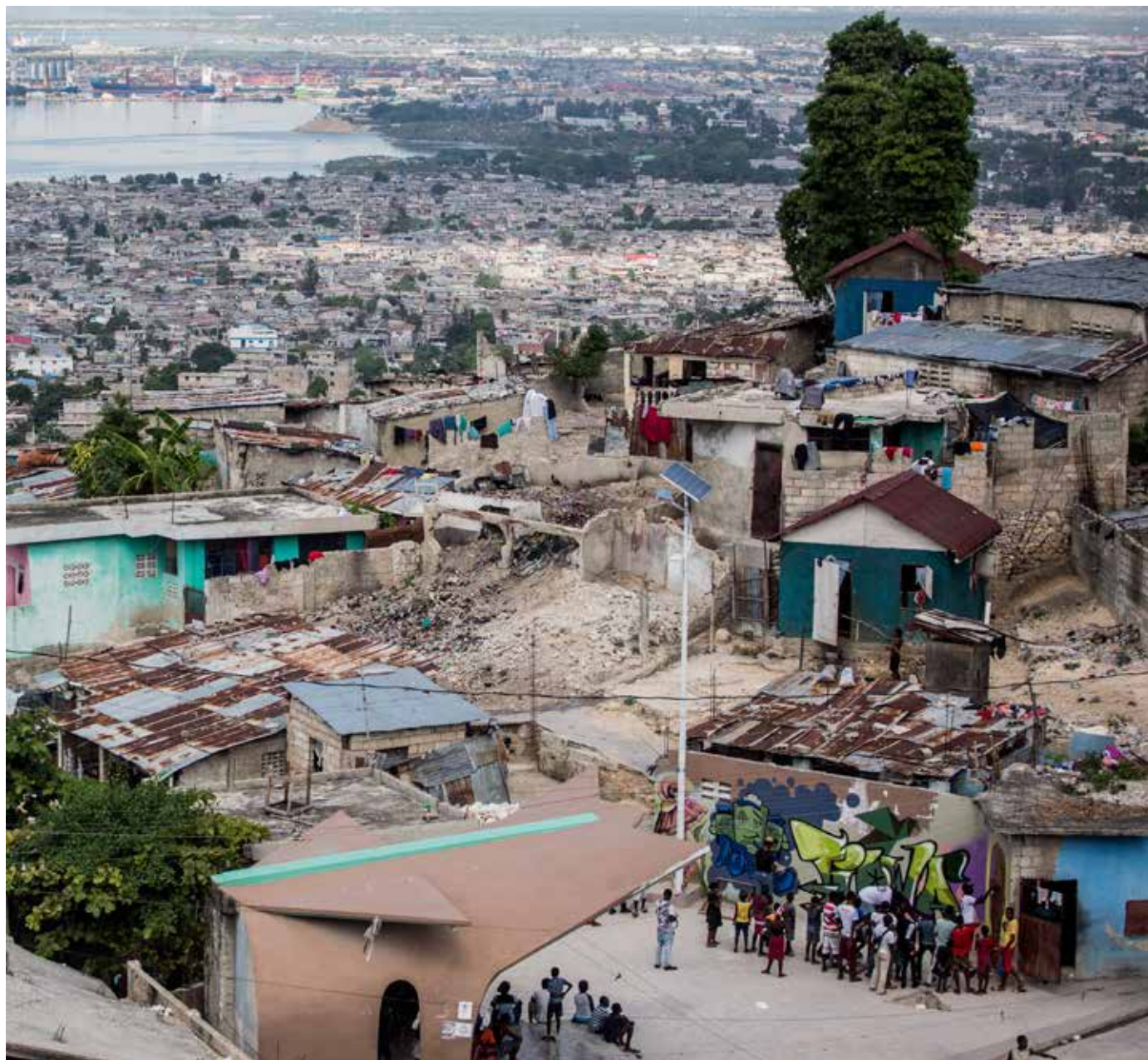
Tag mural by Azuei collective, Martissant ▲