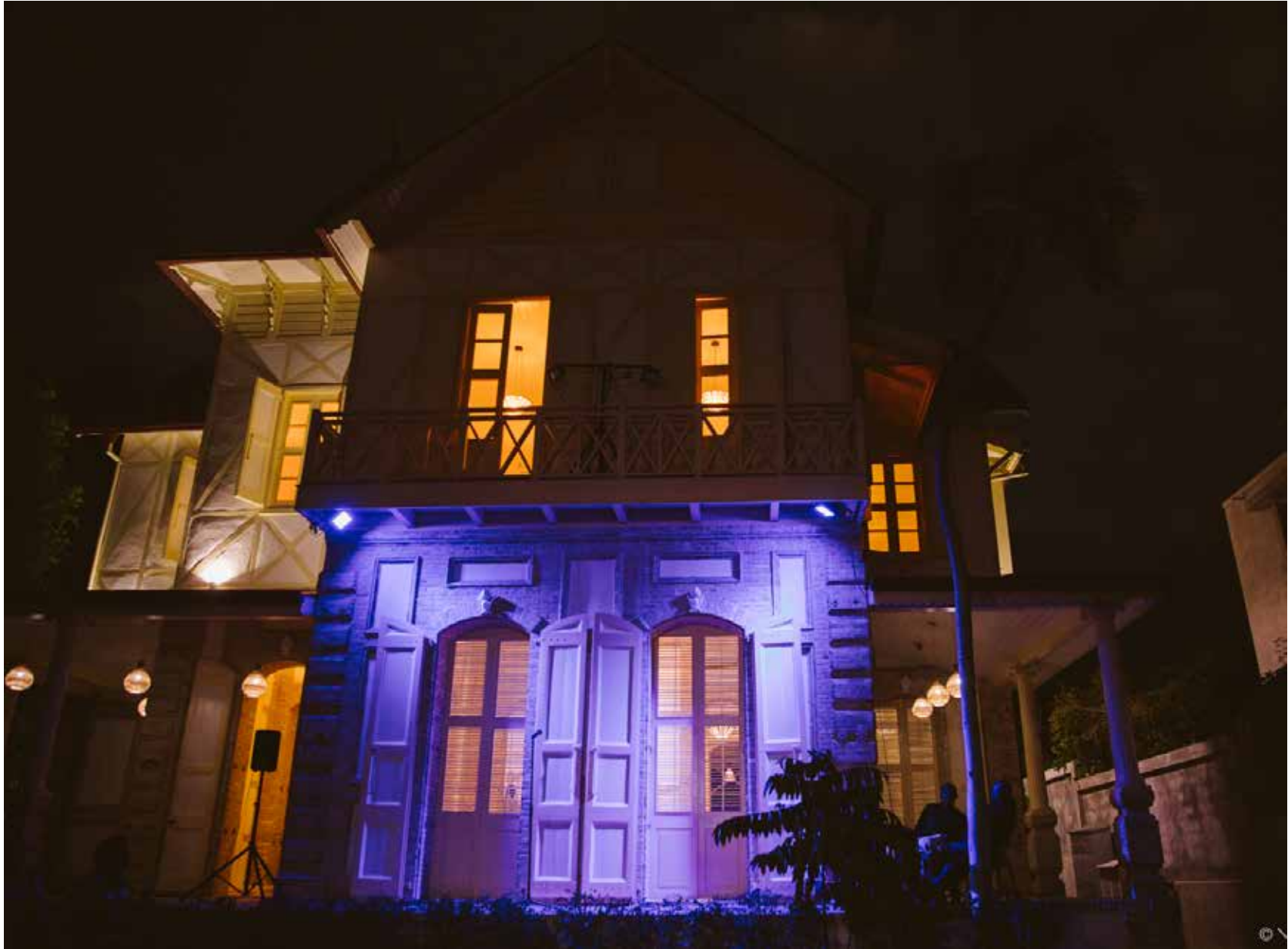
Maison Dufort ▲