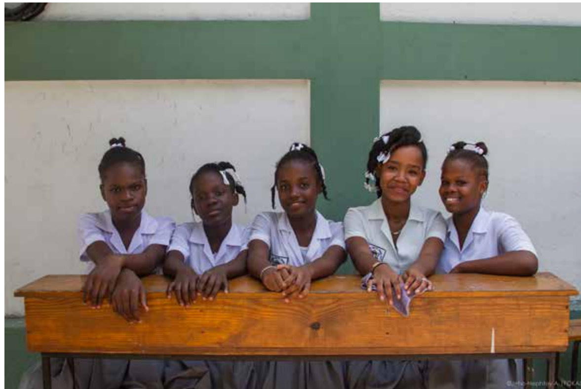
Primary school students ▲

Tipa tipa Foundation commits to continue working on advocacy for children with interested local institutions and other public and private partners.