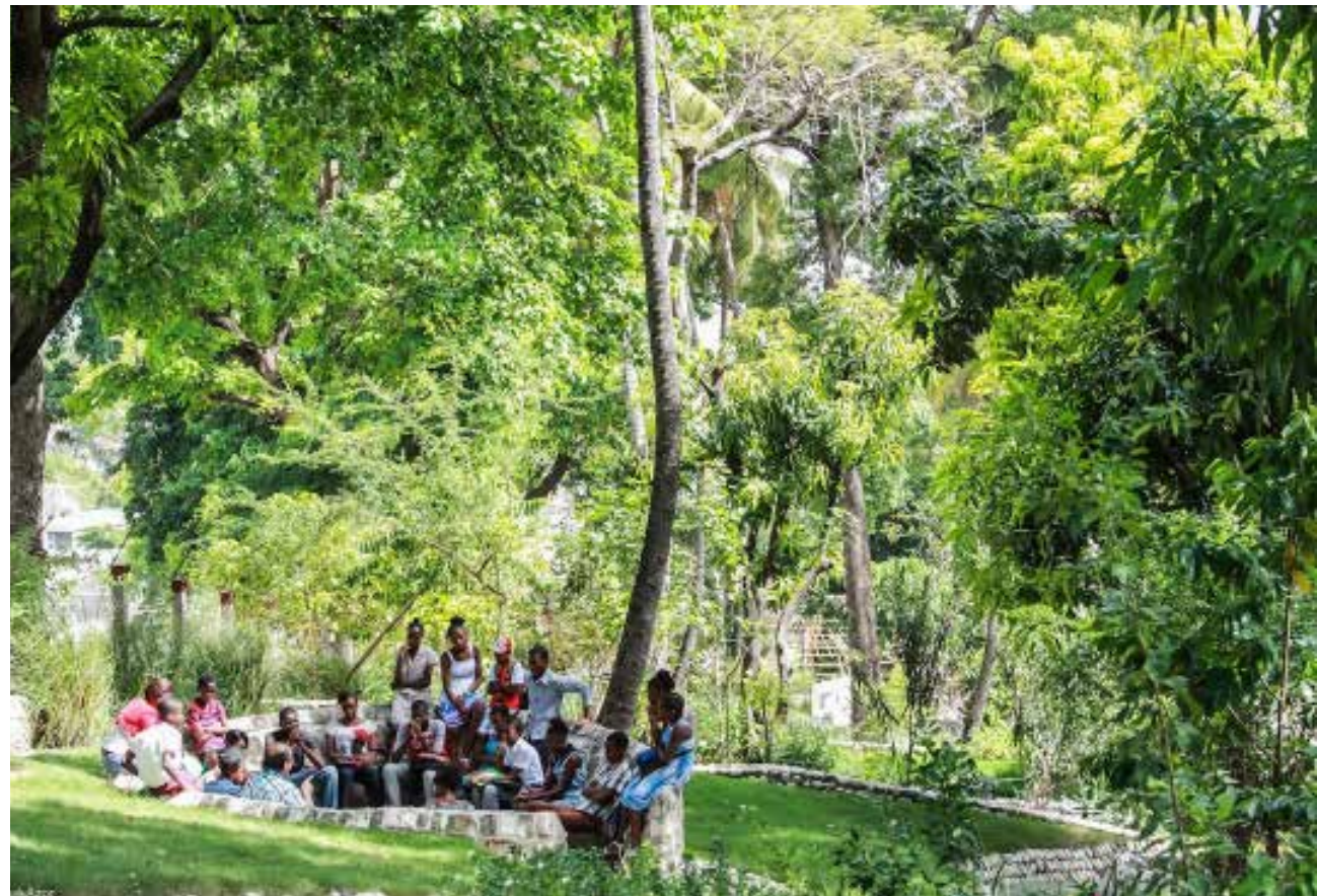
Workshop at the medicinal garden of the Martissant Park

Our Horizon is to gain enough ground with the process of empowerment of local citizens and raising awareness nationally and internationally for this initiative to gather enough momentum to impulse a larger transformative action in the country.