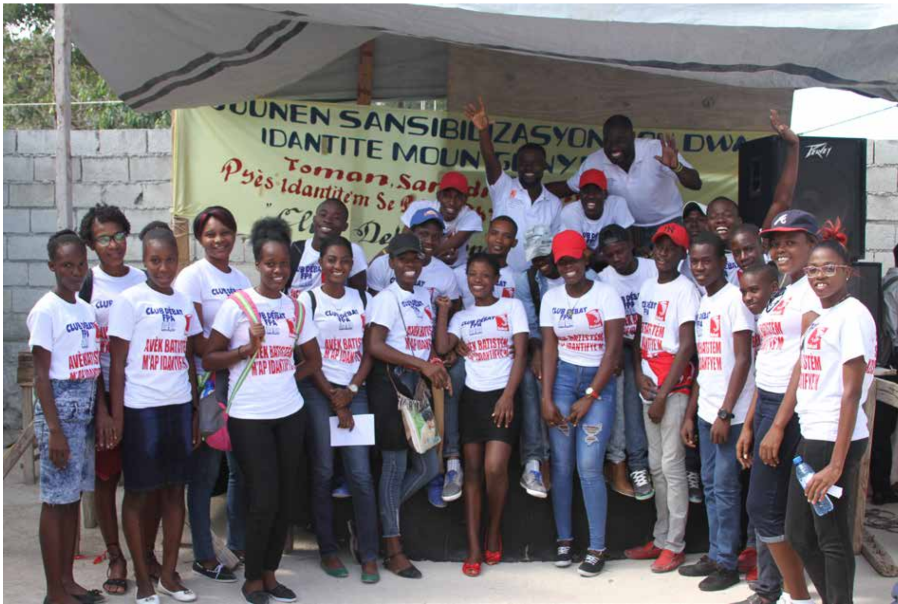
One day information campaign on human rights - Fonds Parisien ▲