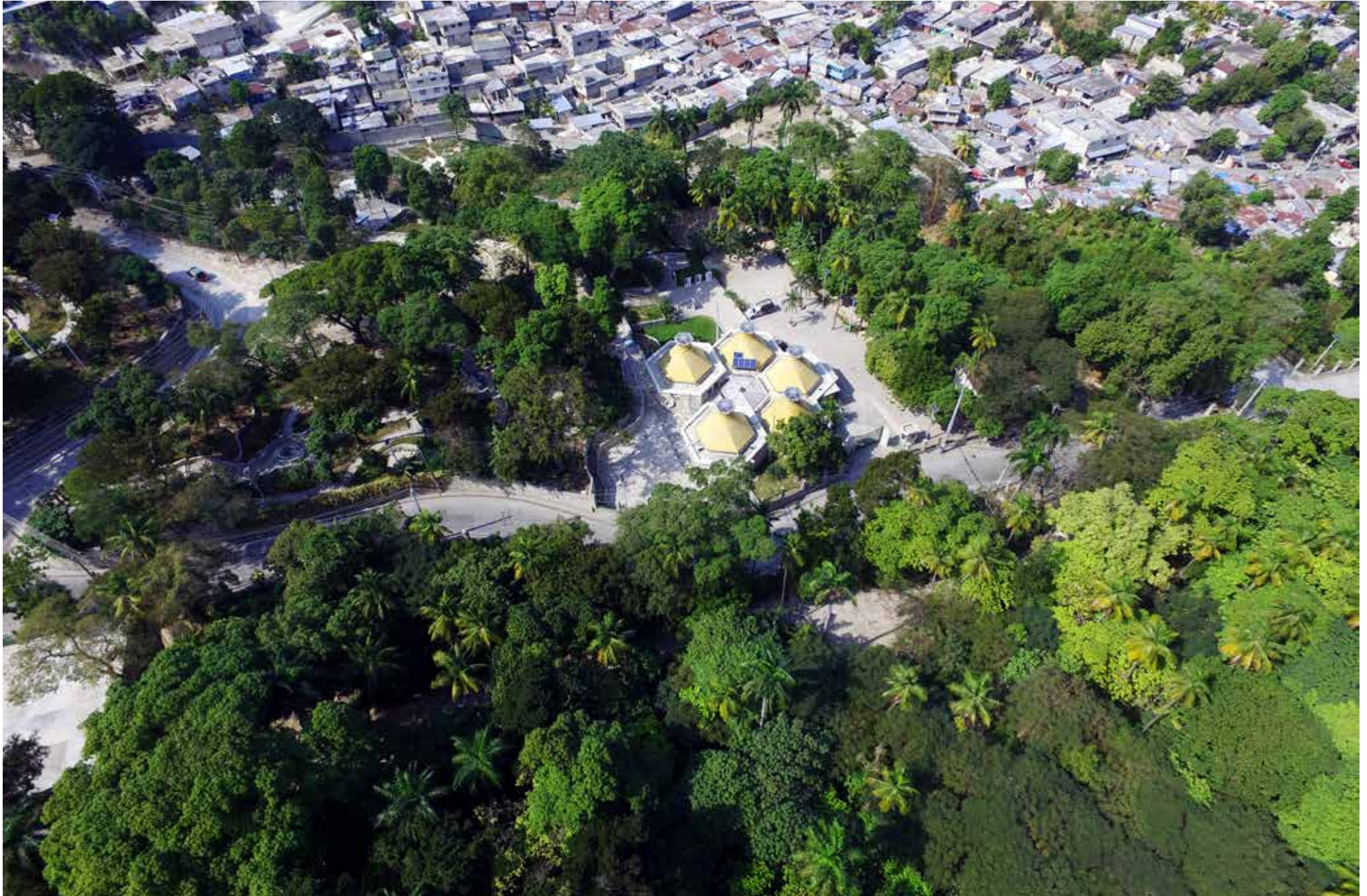
Drone view of the Martissant Park ▲

143, Ave. Christophe, Port-au-Prince, Haïti www.fokal.org | (509) 28131694