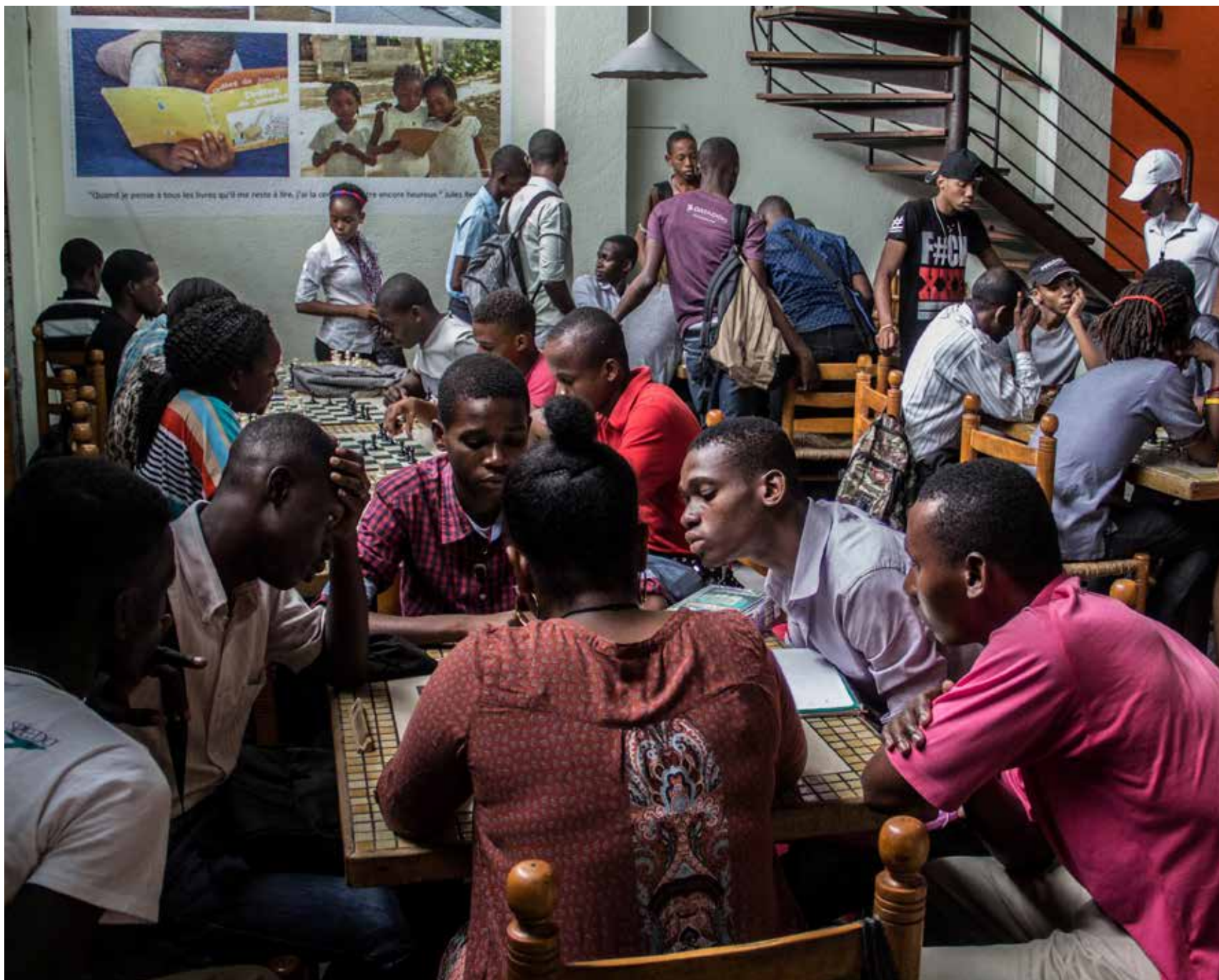
◀ A unique bookmobile, the bibliotaptap